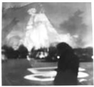
Our Lady in the Sky