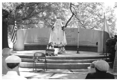
Our Lady of the Roses Shrine