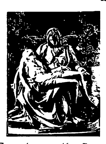
Turn and give your life to Jesus— Bet Him lead you to the Shrine; Safe within His magic circle, Blessed by peace of heart and soul, You will find all Heaven's treasures If you work to reach this goal!

In Her arms so soft and loving Bay the heart of all creation-Jorn and bloody from the torment Wrought by sin's abomination. Oh! dear Mother in Your sorrow, Can You look upon us still, Remembering all the grief we gave You-Can You really love us still? Yes, My dear child, I do love you, With a heart that's pure and kind. I will save you from disaster-Only seek and ye shall find! Jake His heart, so torn with sorrow; Kiss the wounds that sin did bleed. We are living now the past, dear-Bust and envy, hate and greed!! Once again He lays there hanging, Begging you to put aside All the evil man has made To make the road grow long and wide! See the light grow sad and dimmer; Bisten now while there is time!