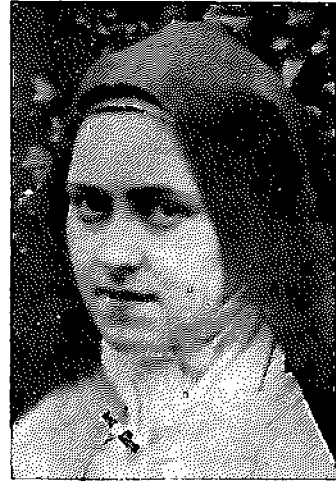
Actual unretouched photo of Saint Theresa