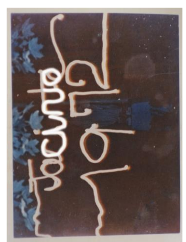
Date of Chastisement from Mitres 2~ Mitre o 2 3