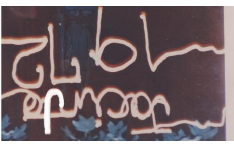
Bishop's Shepherd's Staff on the Chi Ro

Our Lady: "The words of Jesus are: 'Consider this photograph as a puzzle for the human race to figure out. If not solved in due time, I will set the answer upon the world Myself!" -Vigil of May 13, 1978