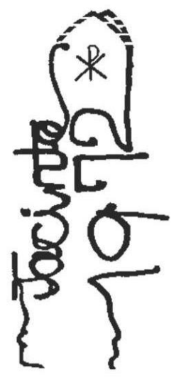
Spinning Ball of Redemption from the Mitres Bending the Cross