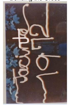
Chi Ro - Christ

Our Lady: "The words of Jesus are: 'Consider this photograph as a puzzle for the human race to figure out. If not solved in due time, I will set the answer upon the world Myself!" -Vigil of May 13, 1978