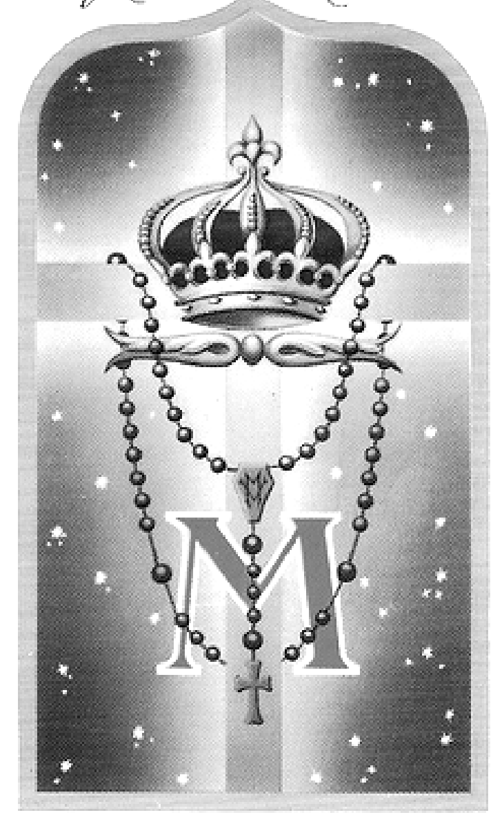
Ora pro nobij