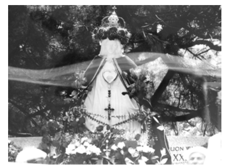
Photo of the Shrine statue at a Sunday Holy Hour and one image on the roll of film captured the flight of the blue angels.

Our Lady: "Veronica saw the flight of the blue angel s that surely evidenced the power of the Father to send the angel s in numerous forms. The blue angel s were gliding within a strong ray of light that appeared to guide them back and forth across the sky. Their wingspan is difficult to describe, for it was like watching a filmy veil of clothing, wispy and gliding back and forth in an amusing, playful manner. Two stars of an extraordinary size appeared before the light over the trees to the left of the statue."