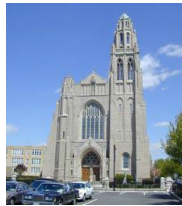
St. Agnes Cathedral

[see editor's commentary below on page 1320]