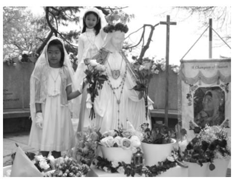
May Crowning 2007