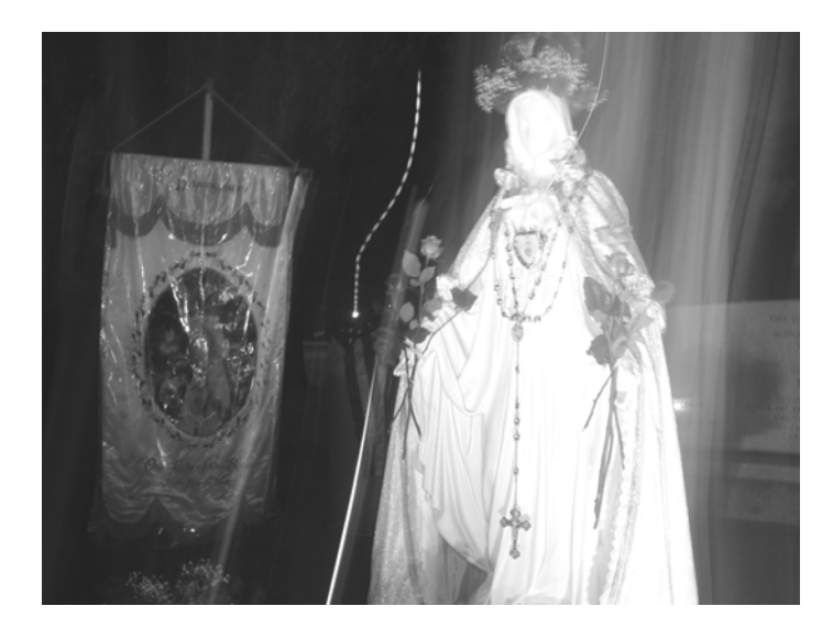
Anniversary Vigil June 18, 2007