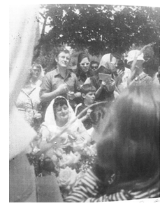
June 18, 1970 – the first Vigil at St. Robert Bellarmine Church