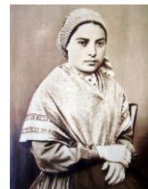
Our Lady of Lourdes to St Bernadette