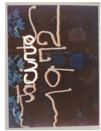
Date of Chastisement "in the wording of Jacinta" 2 Mitre o 2 3