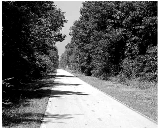
July 15, 1978, Eve of Our Lady of Mount Carmel

Our Lady: "It is a defiant act, My children, that women no longer cover their heads at the Holy Sacrifice of the Mass. They will not obey, for they cannot understand that man must not change the wording of the Bible. Man and the hierarchy must not change the wording of the Bible to suit mankind's instincts. No! The hierarchy must lead the sheep upon the road to Heaven through the plan of the Eternal Father, and this plan has been written in His good Book, the Bible. If you choose to strike out on your own and form a new Bible and a new way, you are doomed to disappointment and destruction. And worst of all, it will be soul destruction!"