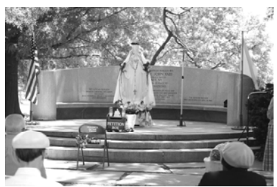
Our Lady of the Roses Shrine