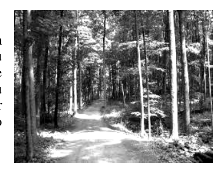
April 5, 1975, Eve of the Annunciation of the Blessed Virgin Mary

Our Lady: 'Do not be concerned of the knowledge of the world. Do not concern yourselves, My children, of the acceptance of mankind in your world. I have given you the knowledge in the past that in order to follow the narrow road to Heaven, you must be different. You cannot be of your world, earth, and in the spirit. One or the other you must choose. The world of the spirit has nothing in common with the world of man. For satan is directing the course and actions of mankind, for he does not call to the Holy Spirit to guide him."