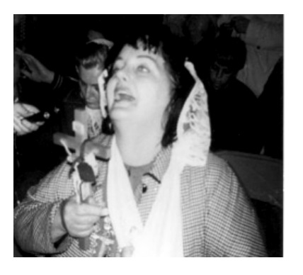
Vigil of May 10, 1973