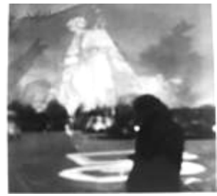
Our Lady in the Sky