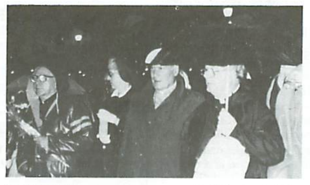
Over 5,000 pilgrims—many who came on the 70 buses—including many priests and religious, gathered from around the globe enduring a driving rainstorm to honor Our Lady of the Roses.

"I want you to stress, My child, the existence of hell and purgatory. It has been forgotten by many. Even the priests in My Son's churches have overlooked this essential knowledge. In fact, some now mock it as being untrue. My child and My children of the world, please believe Me. I have been through purgatory. I have been through hell. And I tell you all: please, do penance for your brothers and sisters who do not have the way.