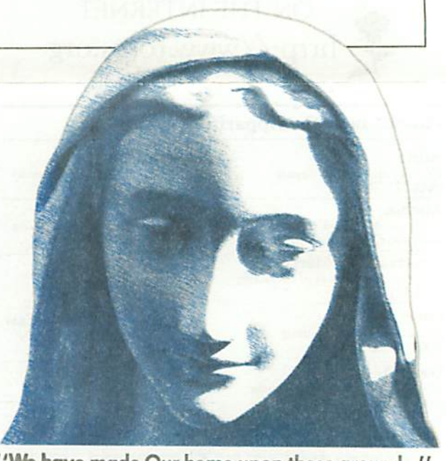
"We have made Our home upon these grounds."

Our Lady of the Roses, Mary Help of Mothers Shrine (718) 961-8865 (888) 349- MARY 24 hr fax (718) 939-3938 Internet Web Site: http://www.roses.org