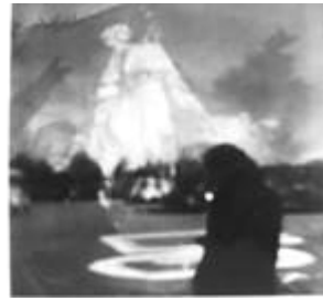
Our Lady in the Sky