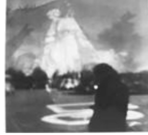
Our Lady in the Sky