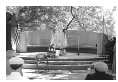
Our Lady of the Roses Shrine