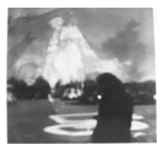
Our Lady in the Sky