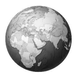
July 15, 1973, Eve of Our Lady of Mount Carmel