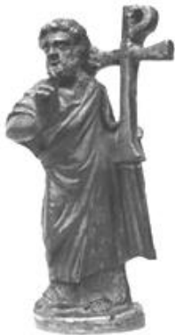
St. Peter, the first Pope holding the crosier, Chi Ro (XP, Greek for Christ)

Jesus: I must admonish all bishops and cardinals that again, without prayer and determined efforts for penance, their minds will remain clouded. Their involvement in the world of satan will make them fair game for his plan, the plan of Lucifer to capture the Seat of Peter. October 6, 1978