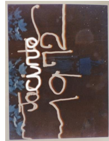
Date of Chastisement "in the wording of Jacinta" 2 Mitre o 2 3