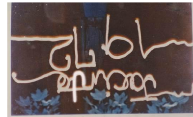
Bishop's Staff – Shepherd of Souls