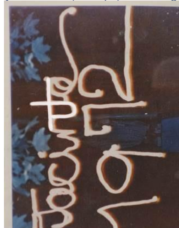
Chi Ro - Christ