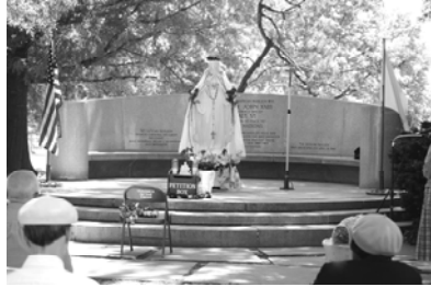
Our Lady of the Roses Shrine