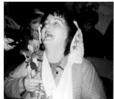
Vigil of May 10, 1973