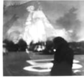
Our Lady in the Sky