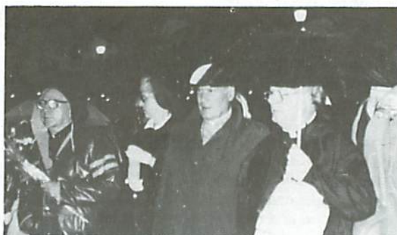
Over 5,000 pilgrims—many who came on the 70 buses—including many priests and religious, gathered from around the globe enduring a driving rainstorm to honor Our Lady of the Roses.

"I want you to stress, My child, the existence of hell and purgatory. It has been forgotten by many. Even the priests in My Son's churches have overlooked this essential knowledge. In fact, some now mock it as being untrue. My child and My children of the world, please believe Me. I have been through purgatory. I have been through hell. And I tell you all: please, do penance for your brothers and sisters who do not have the way.