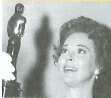
Susan winning her Oscar in 1959 for her performance in "I Want to Live!"