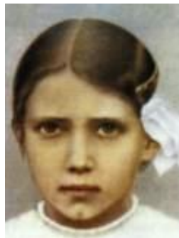
Jacinta Marto of Fatima, the child seer of Our Lady of Fatima