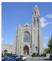
St. Agnes Cathedral