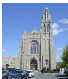
St. Agnes Cathedral